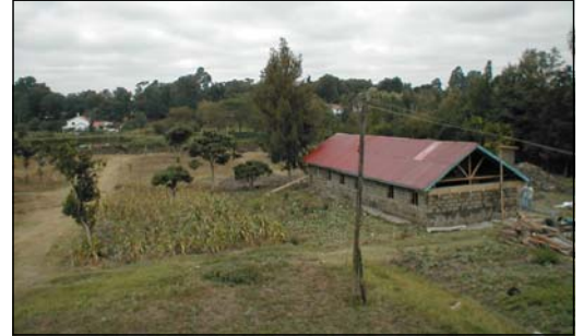
View of the property, future home to the Dellamater's