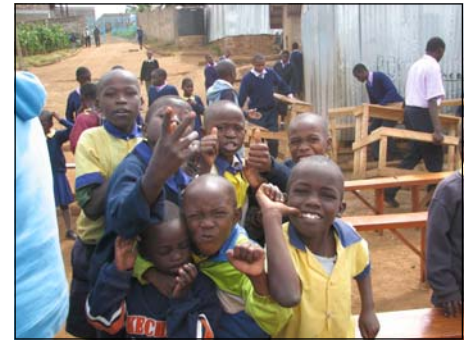
The children of Nairobi, Kenya